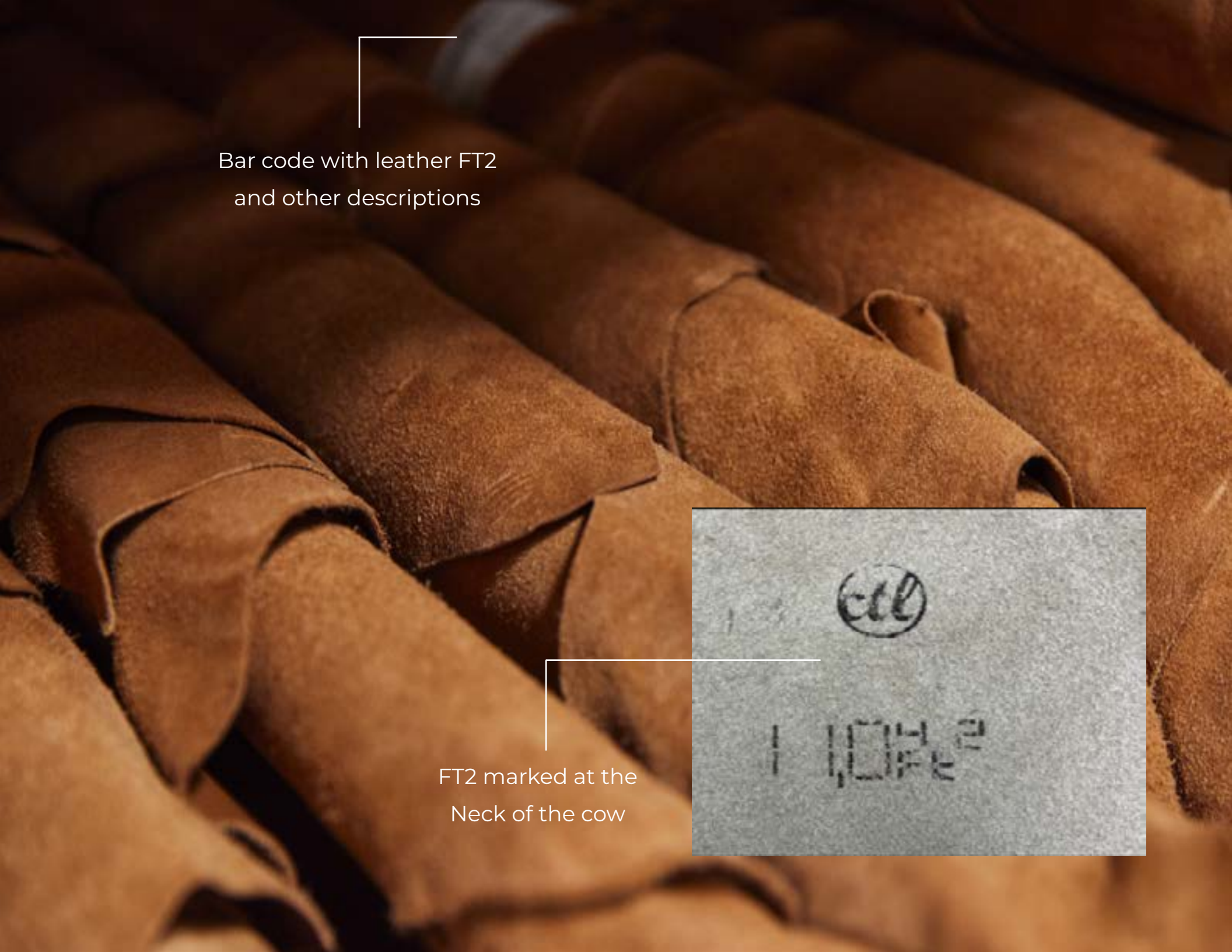
FT2 marked at the Neck of the cow