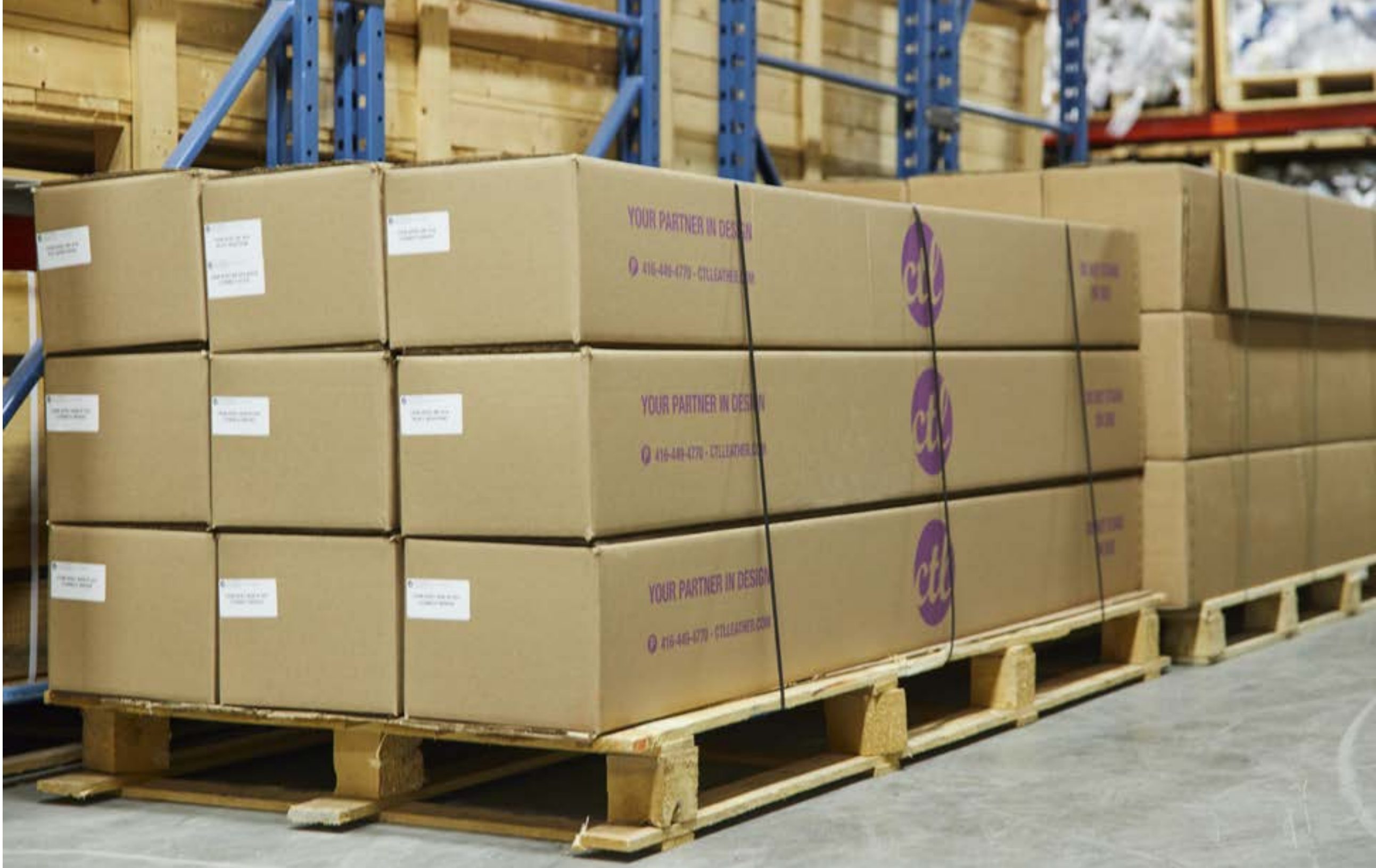
BOXES ON SKIDS (96X48XTBD): WILL BE STRAPPED AND SHRINK WRAPPED